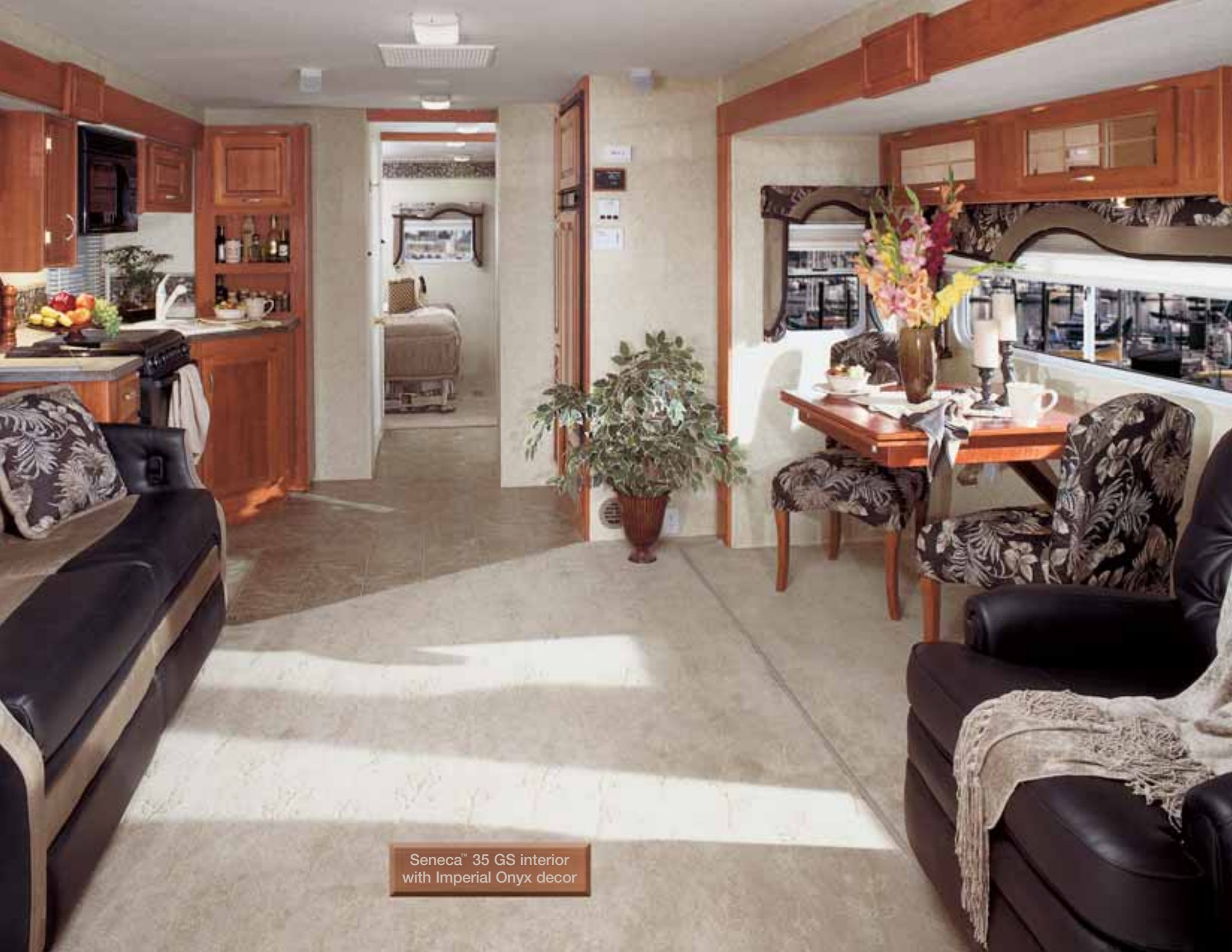
Seneca™ 35 GS interior with Imperial Onyx decor