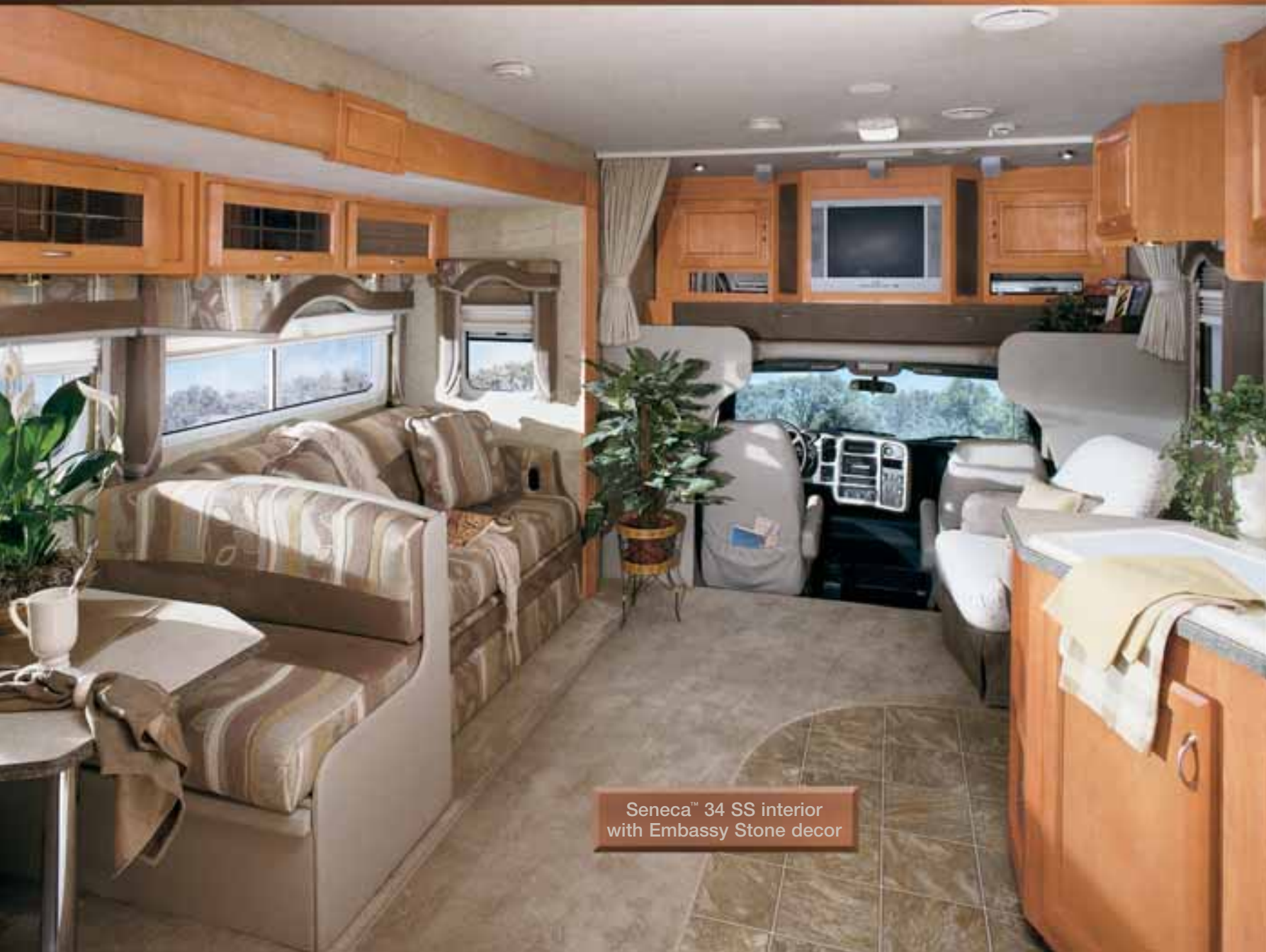
Seneca™ 34 SS interior with Embassy Stone decor

Sometimes finding a place to fit in is easier than you think.