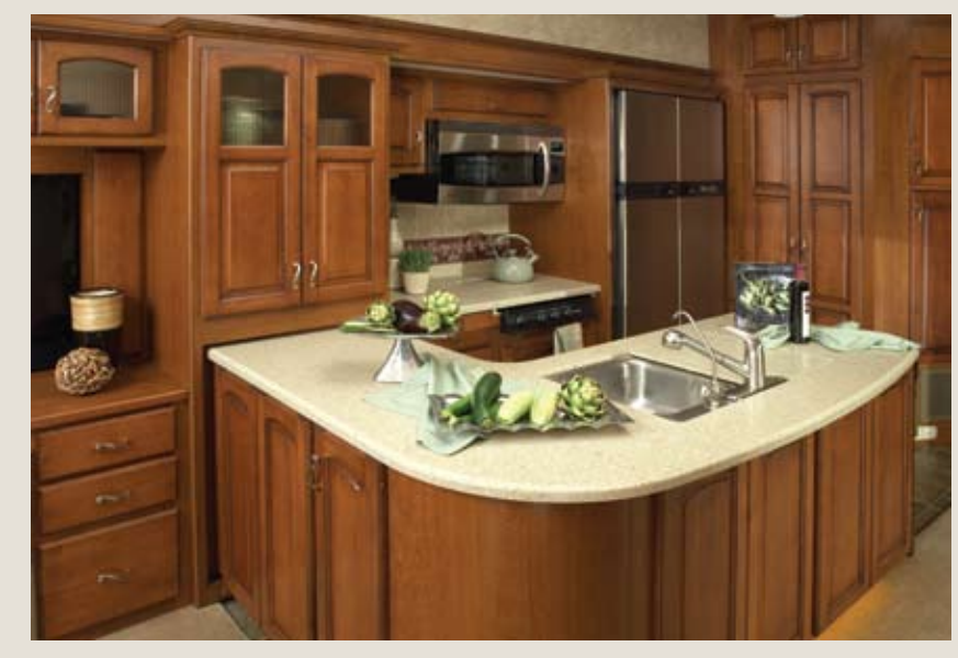
The spacious Legacy kitchen designs are accented by rich Washington Glazed Maple hardwood cabinetry, the finest stainless steel appliances and high-gloss DuPont ™ Corian® countertops.