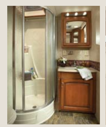
A large radius shower with skylight combines with sleek nickel fixtures and rich woodwork to give the Legacy's bathroom a distinctive feel.