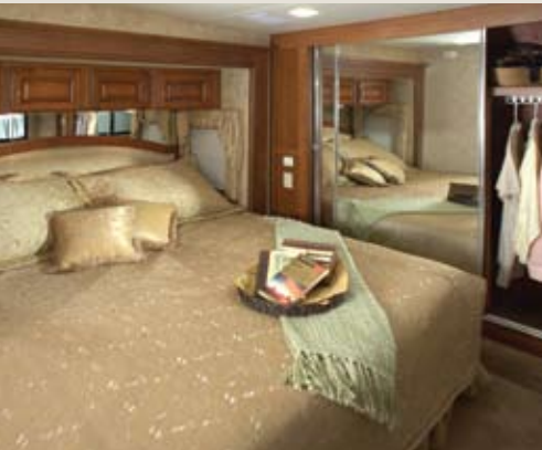
The Legacy bedroom is richly appointed with decorative pillows, a quilted bedspread and even a cedar-lined wardrobe