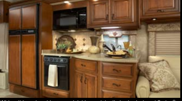
With solid maple cabinetry, an inlaid porcelain tile backsplash and Corian® countertops, the Insignia kitchen is built for beauty and functionality.