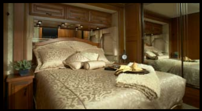
The richness found throughout the 2009 Insignia continues into the bedroom with a deluxe pillow top mattress, spacious wardrobe and 26" LCD HD TV.