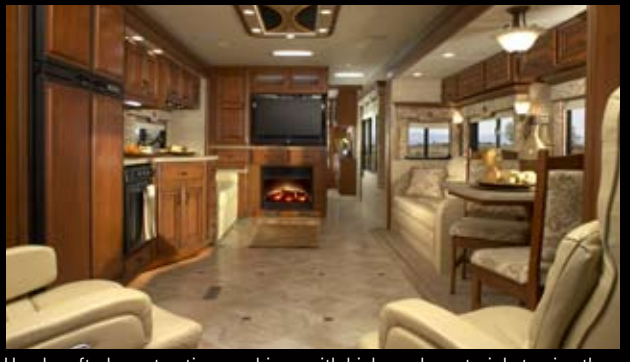
Hand-crafted construction combines with high-grade materials to give the Insignia floorplans distinction and durability.